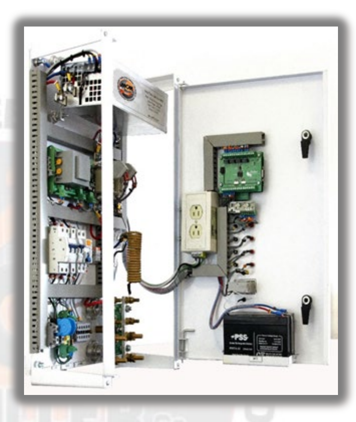
SMR FRONT VIEW WITH DOOR